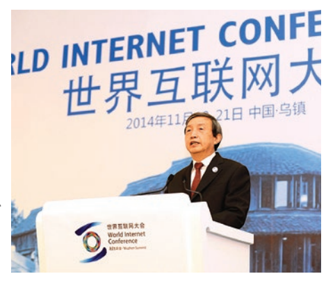
Chinese Vice Premier Ma Kai speaks at the opening ceremony of the World Internet Conference in Wuzhen.

China organized its own international conference, the World Internet Conference in Wuzhen. The purpose of Wuzhen is simple, argue some: "to promote the Chinese Communist Party's vision of Internet governance to an international audience and to gain allies against the perceived Western encroachment upon China's cyber sovereignty."