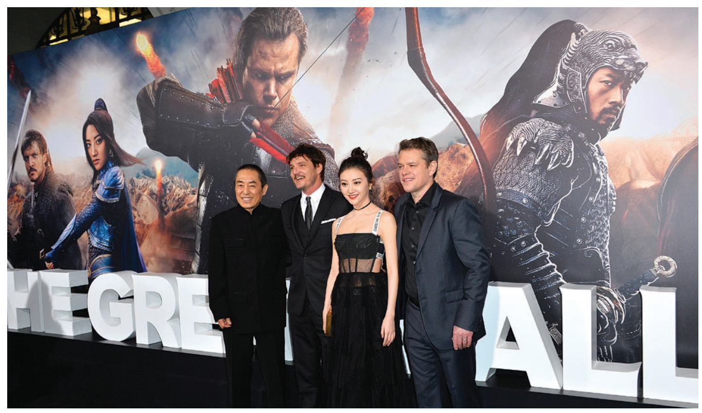
Director Zhang Yimou, actors Pedro Pascal, Jing Tian & Matt Damon at the premiere for "The Great Wall"

Now those partners have embarked on the most prominent US-China co-production to date, the $150 million film The Great Wall , directed by famed director Zhang Yimou and starring Chinese stars alongside US stars such as Matt Damon. Partners include Legendary, Universal pictures, the state-owned China Film Group, and Le Vision Pictures.<sup>125</sup> Great Wall is seen as the first attempt at a genuine homegrown, English-language crossover;<sup>126</sup> on its first day in China, it grossed a respectable if not overwhelming $24.3 million, and garnered mixed reviews online.<sup>127</sup> And other major US entertainment firms are gearing up to enter the market as well: Walt Disney is readying a major push into China, entering a multi-year partnership with the state-owned Shanghai Media Group Pictures in 2014 to make Disney-branded films in China.<sup>128</sup>