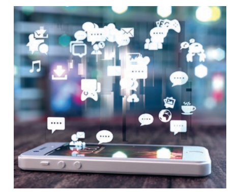
State-owned media's attempts at utilizing social media and memes to appeal to a global, information-saturated audience have met with mixed success.

Yet a Reuters investigation in 2015 sparked an FCC investigation, when Reuters reported that CRI's local US partners were three Chinese expatriate businessmen who ran the international network and in some cases owned stakes in the stations. US and Chinese corporate records showed that a Beijing-based subsidiary of CRI owned 60 percent of an American company leasing almost all the station's airtime (US law prohibits foreign governments or their representatives from holding radio licenses for US broadcast stations).<sup>51</sup>