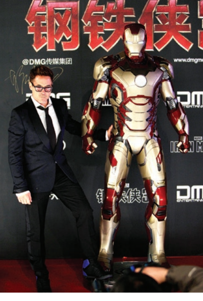
Robert Downey Jr. poses for a photo during a promotional event of the movie "Iron Man 3" before its release in China at the Imperial Ancestral Temple of Beijing's Forbidden City in April, 2013.

While in the past, Hollywood studios were chiefly concerned about how to excise material from the finished film in order to get it past the censors to access the Chinese market, now decisions about content are made straight at the source: when movies are conceptualized and made.